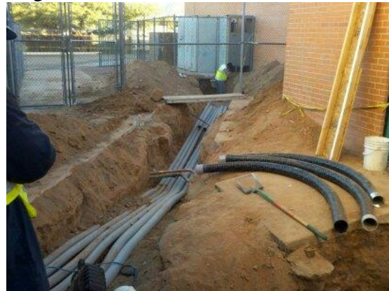
New Underground Electrical and IT Service Pathways