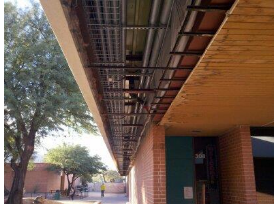
New Overhead Electrical and IT Service Pathways