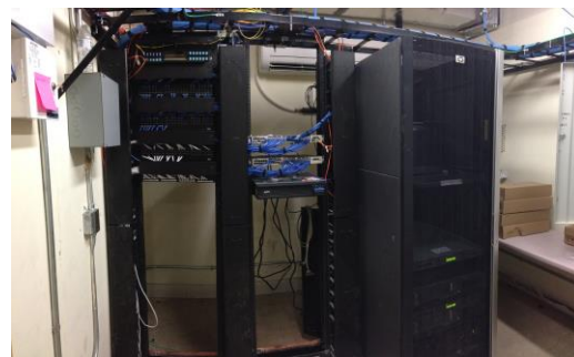
New IDF in "A" Building

Punch list corrections in all completed areas are in process.