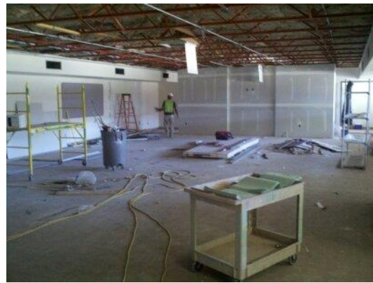
CDO Café Work in Progress