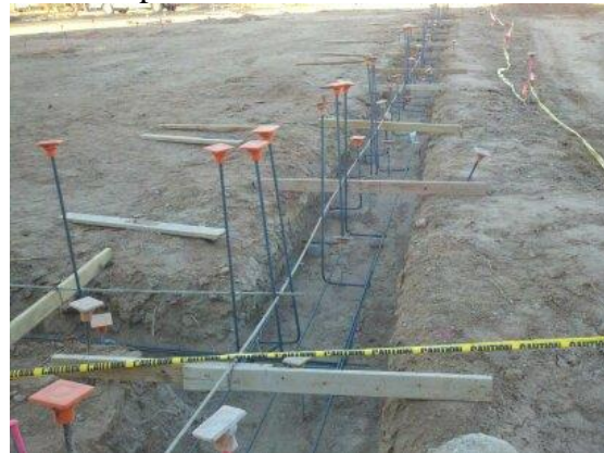
New Classroom Building Footers